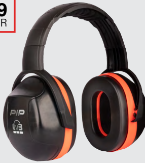
PIP® Vseries™ V3 263V3HB