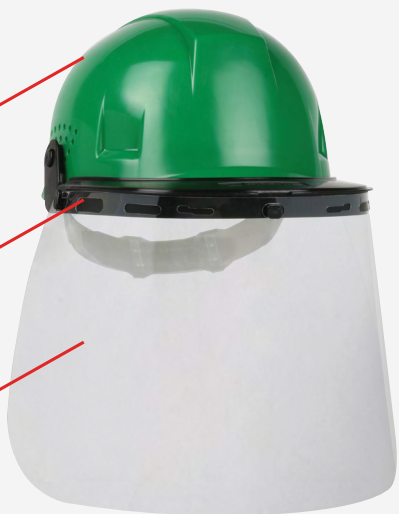
Dynamic® Clear PETG Splash Visor (EP81540)