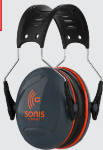
JSP® Sonis® Compact 262AEB030HB