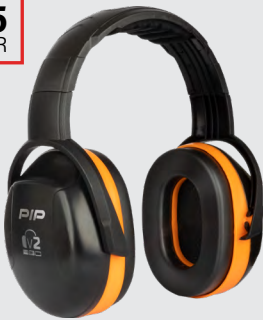
PIP® Vseries™ V2 263V2HB