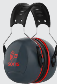
JSP® Sonis® 3 262AEB040HB